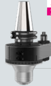
Corpo - Body